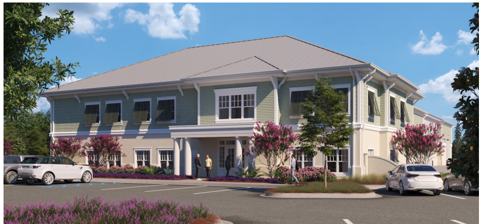
Renderings of the new CHELCO office and operations center in Freeport, Florida

This facility represents more than just a building; it's a symbol of our commitment to better serving our growing community. Situated on a 14.4-acre parcel, the new facility will house a 28,700 square foot main building, a 10,000 square foot storage facility and approximately 8 acres of improved surface for equipment laydown, such as transformers and poles.