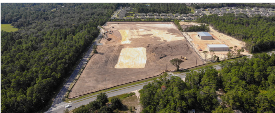
Site work is underway on CHELCO's new Freeport office located off Hwy. 20 and W. Bay Loop Road