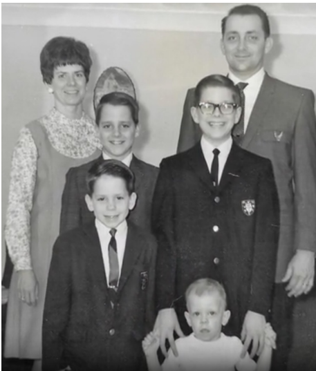
My parents raised a family of sharp-dressed young men! That's me, the younger one on the left, with my parents and brothers, circa 1968-ish.

Losing my mother was hard on me and my three brothers. But even while grieving the loss of his life partner, my father remained steadfast, providing fatherly love and support to the whole family.