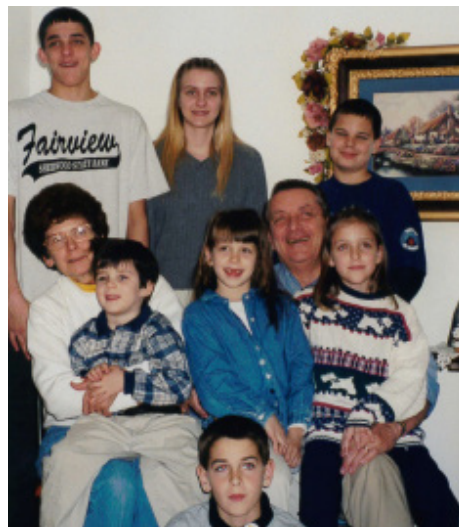
My parents with their grandkids in 2000.