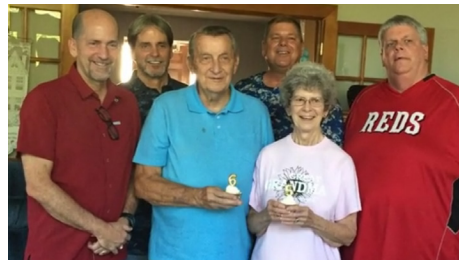
My parents were blessed with 68 years of marriage. Here they are with my brothers and me at their 65th anniversary.

Becoming a father is the most life-changing event in a man's life - at least, it was for me. It doesn't matter how old you are when you first become a father, or how many nieces and nephews you may have; nothing