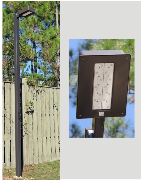
Shoebox fixture mounted on aluminum pole

Single LED $42.00 Double LED $59.18 Color: Black