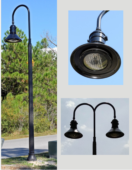
Prague fixture mounted on fluted concrete pole

Single LED $42.00 Double LED $59.18 Color: Black