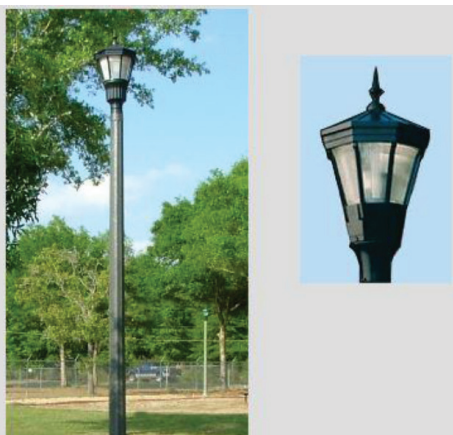
Arlington fixture mounted on fluted concrete pole