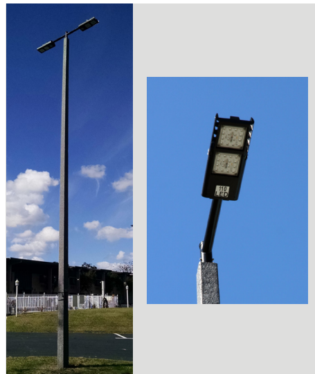
Corvus fixture mounted on 35' concrete pole

Single LED $29.74 Double LED $37.11 Color: Black