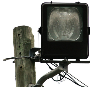
400 Watt Flood $14.06/month