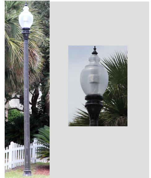
Washington Post fixture mounted on fluted concrete pole