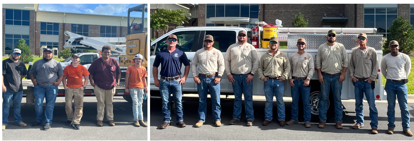
Southland Utility Services Crew